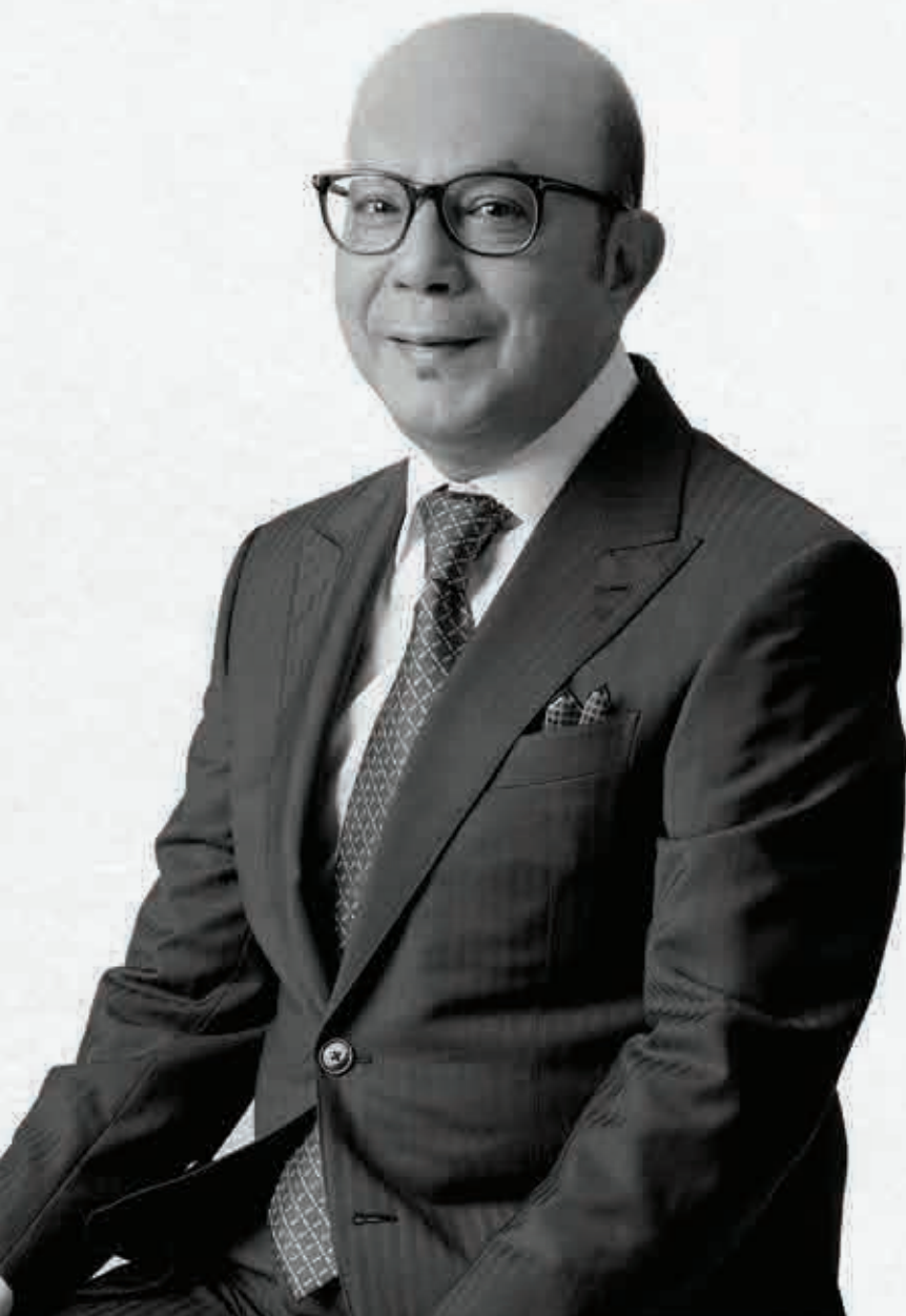
DATUK SYED ZAID BIN SYED JAFFAR ALBAR