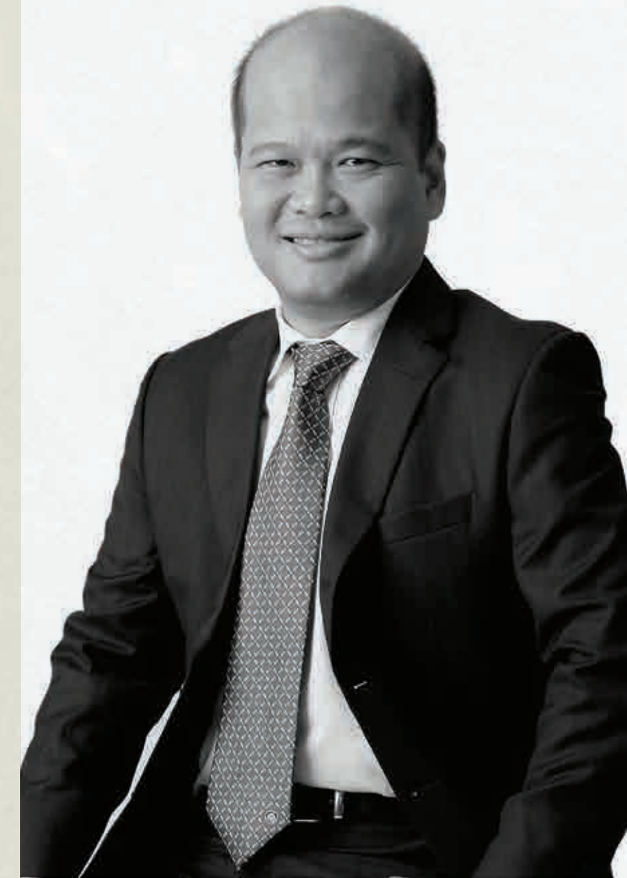
DATUK SHAHRIL RIDZA BIN RIDZUAN