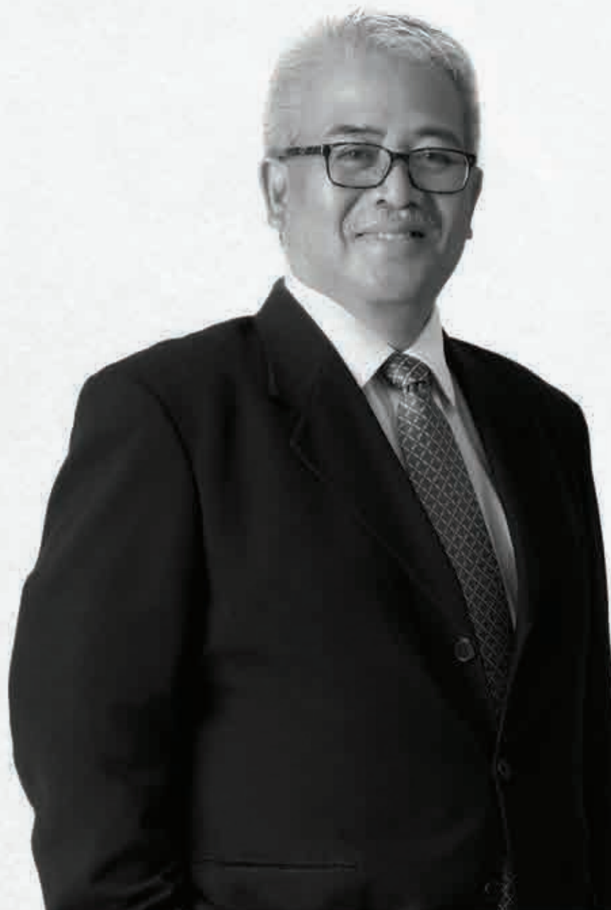
DATUK JOHAR BIN CHE MAT