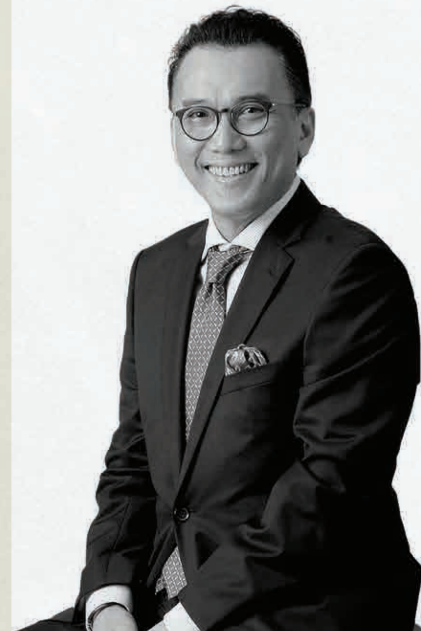
DATO' JASMY BIN ISMAIL